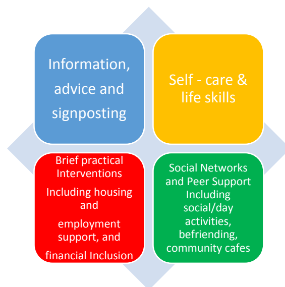
Figure 1: Mental health hub core functions

There is also strong evidence of the benefits that peer support can provide, and how people can find it beneficial to speak to someone who has also experienced mental health issues. Peer support was also strongly supported by people during the recent engagement, and particularly by people using services.